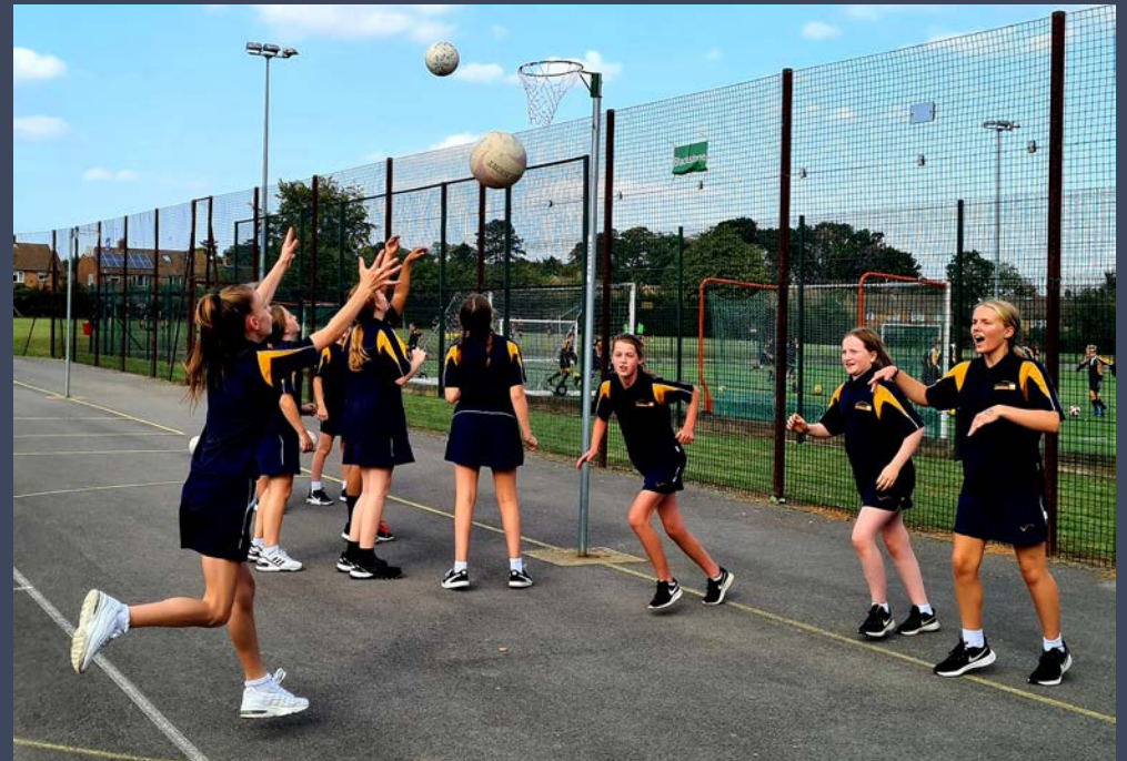
Year 7 Netball Club (Sept 2020)