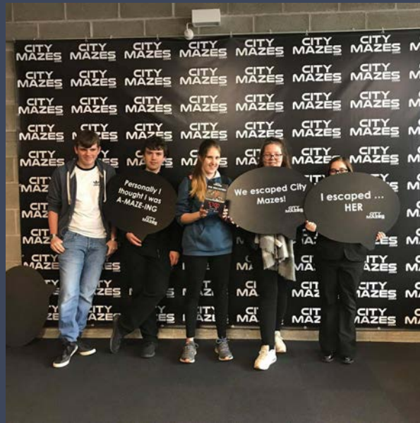
Escape Room - Skills Stars