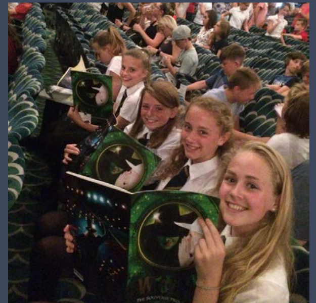
Wicked - Expressive Art Stars