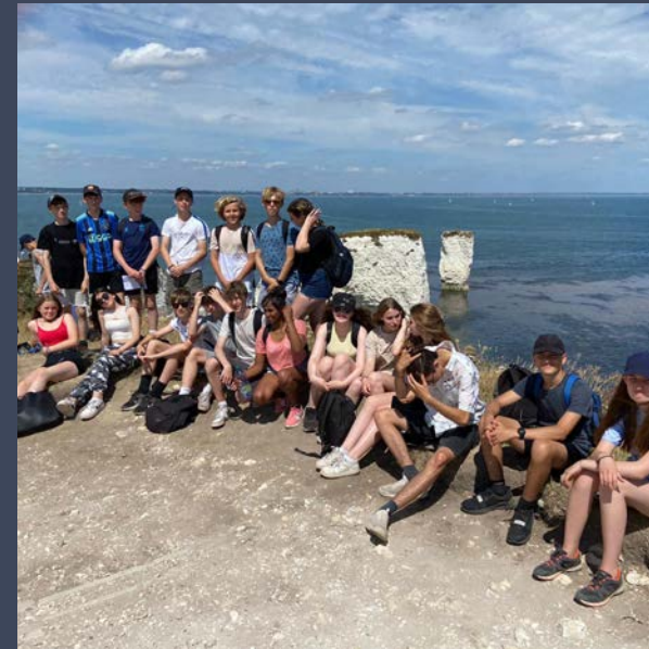
Old Harry Rocks (July 2022) - Year 9 Geography