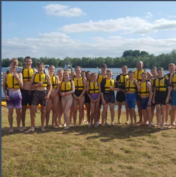
Wet & Wild - PE Stars