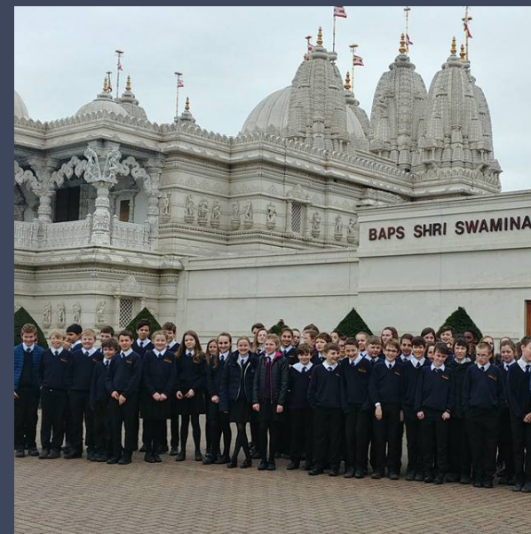
Neasden Temple (April 2019) - Year 7 Religious Studies