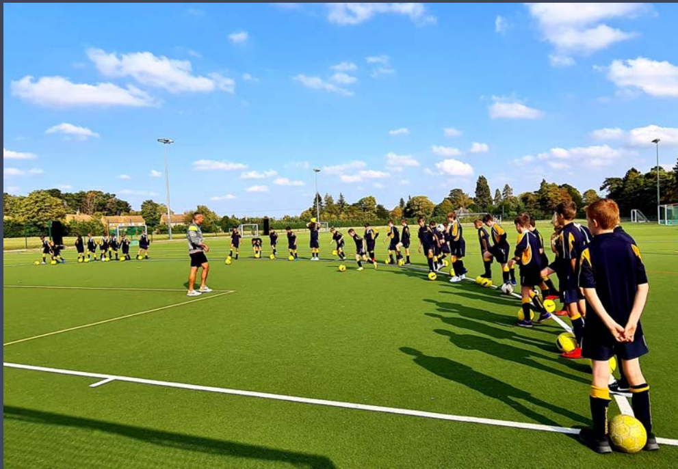
Year 7 Football Club (Sept 2020)

Our sports club timetables change on a termly basis.