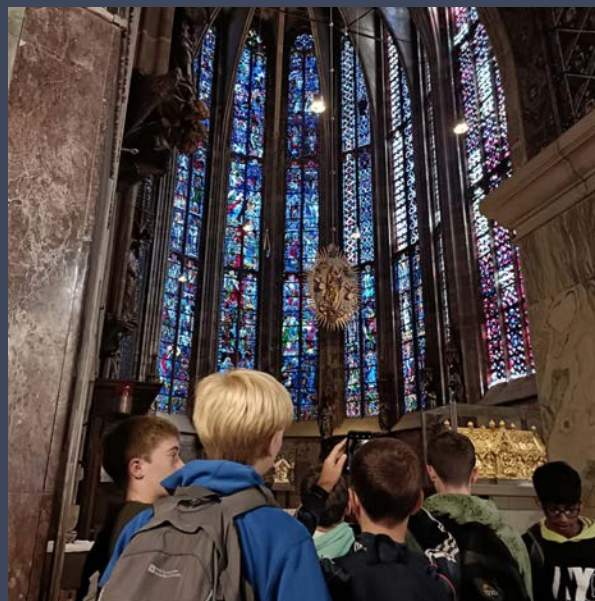
Aachen (Sept 2022) - Year 9 German