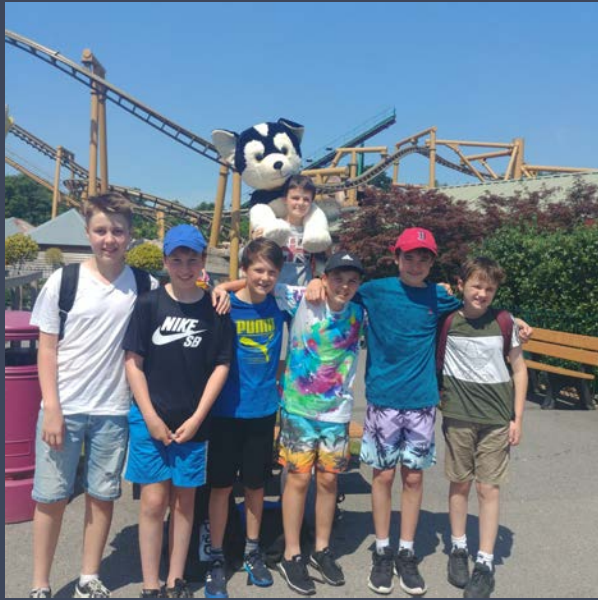
Paultons Park - All Stars (July 2019)