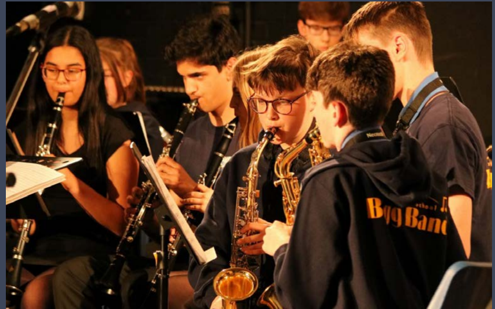
Spring Concert (March 2019)

In Dance, students develop their performance skills, working as individuals and in groups. As they move up the school, they focus increasingly on their own choreography. The Spotlight Dance Show is an annual opportunity in school for students to celebrate dance in front of an audience, while many choose to combine their studies with membership of local dance groups and productions.