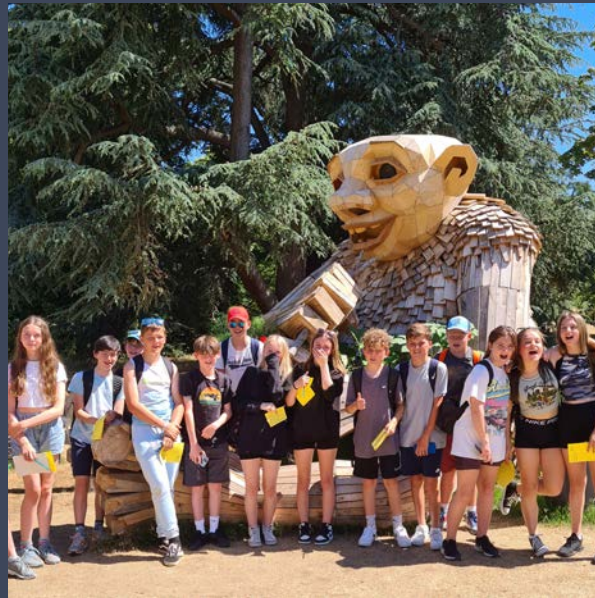
Kew Gardens, London (July 2022) - Year 7 Geography