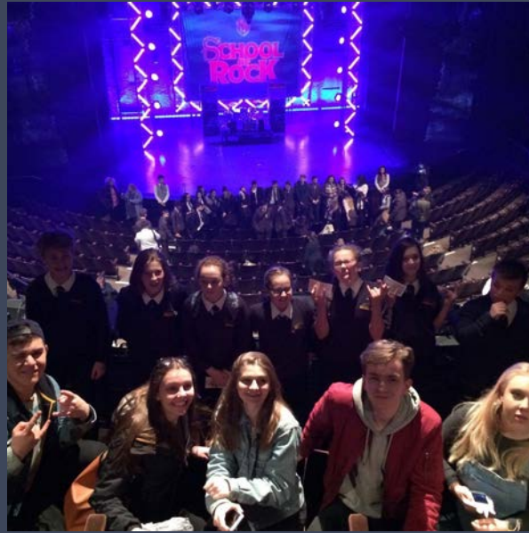
School of Rock - Expressive Art Stars