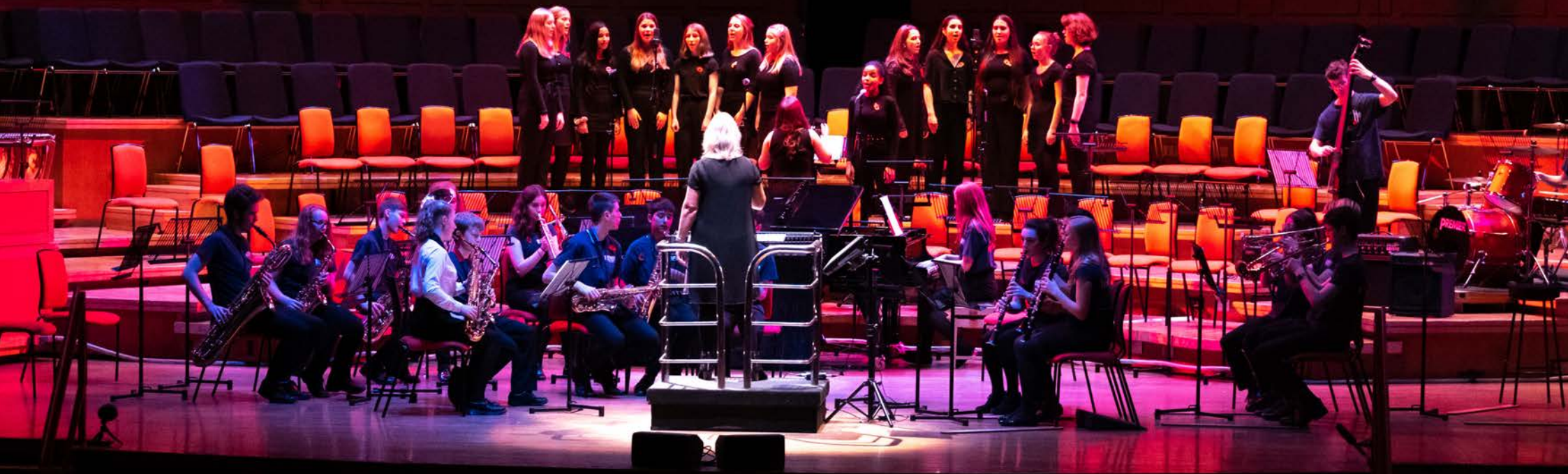
Big Band performing at the Merchant Taylors' Company Remembrance Concert (November 2018)