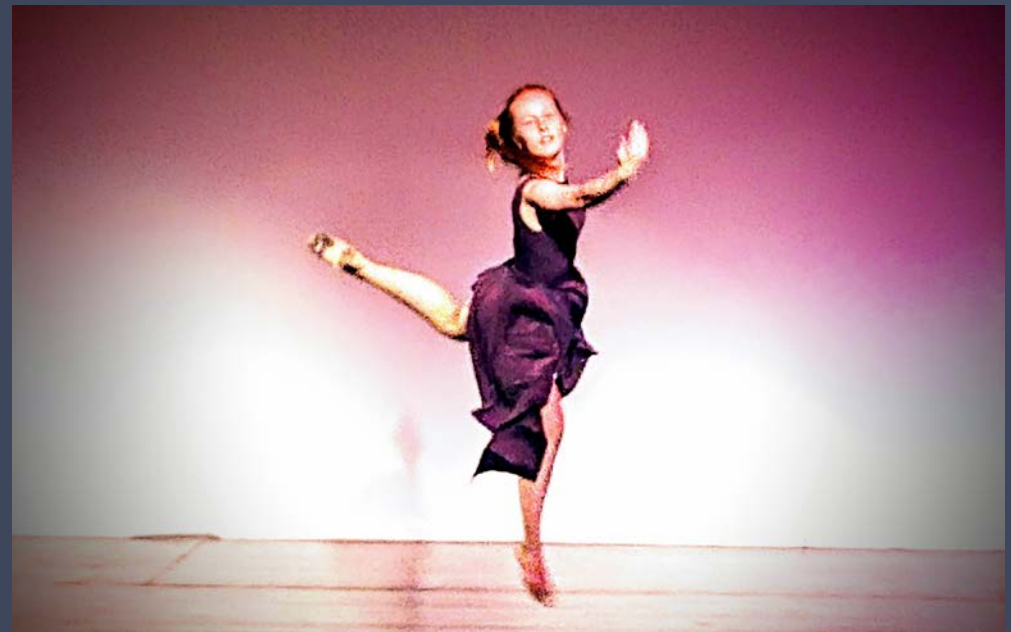
Spotlight Dance Show (March 2019)