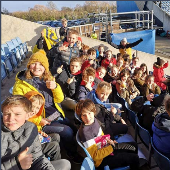
Oxford United - Christie House Social