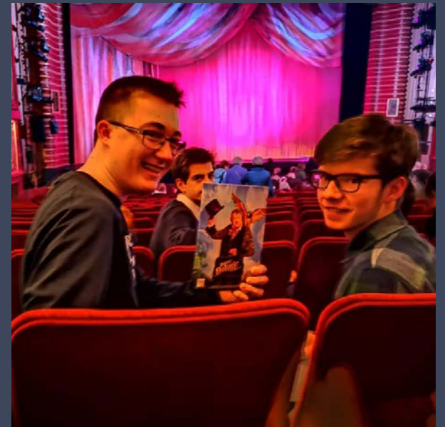
Dr Dolittle - Expressive Art Stars