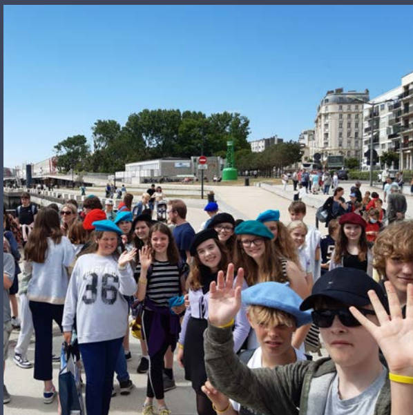
Boulogne (June 2022) - Year 8 French